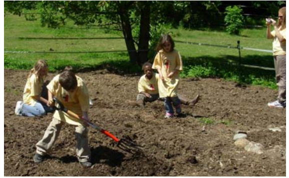
Camp Sparkle kids working hard, planting the pumpkin patch this summer!

It will be a fun afternoon, and we hope to see you there!